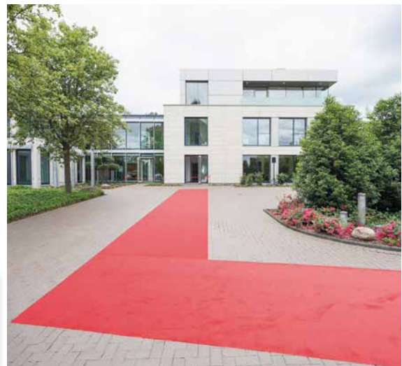
THE ADDITION THAT WAS COMPLETED IN THE SUMMER OF 2017 OFFERS SPACE FOR 18 EMPLOYEES AND THREE CONFERENCE ROOMS.